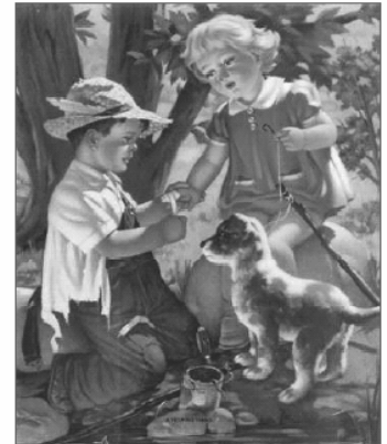
Includes sharing with those in need